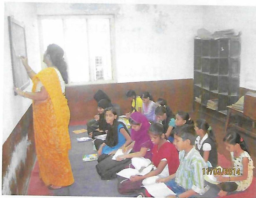
No. of students in the Coachig Class is 40

Coaching class is held at our premises 12 Watkins lane. Here students from the slums come for coaching , mainly in Bengali subject. Since 90% of the students are Hindi and Urdu speaking and they find difficulty in understanding the subject. There are two classes one for primary (Class I to V) and the other for higher classes (Class 6 to 10) there are two teachers, it runs Monday to Friday 3 pm to 5 pm.