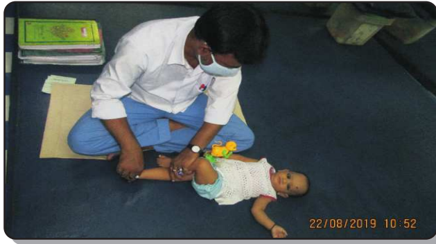
Total Number of Patients Treated During April 2018 – March 2019 at Pilkhana Medical Centre