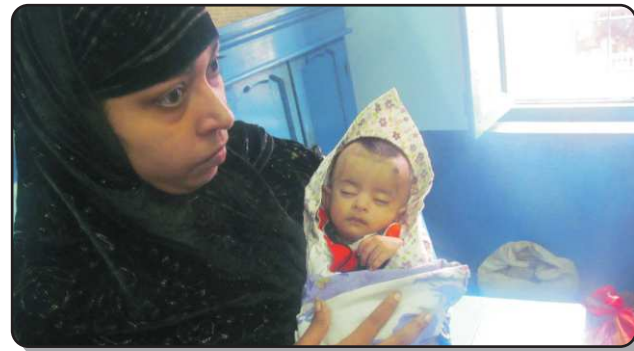
No. of children benefited every week 60

Very poor malnourished children who can not be admitted due to lack of accomodation are provided with Lactogen Milk (400 gm.) and 1 packet Cerelac (300 gm.) every week to consume at their home on the advice of our paediatrician. The children are between the age group of 4 months to 2 years. The children are mostly from the slums of Pilkhana and surrounding areas.