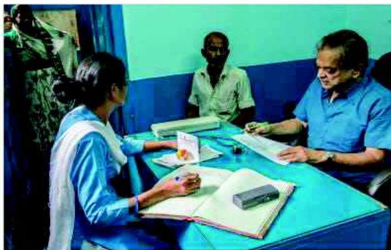
No. of patients Treated during April 2015 to March 2016 is 1691

As mentioned in our earlier report that Tuberculosis is primary an illness of respiratory system and is communicated to other by coughing, sneezing, etc. The disease, is curable by medicines, the medicines have to be taken by patients continuously, for six months to one year depending on the severity of the cases. If medicines are stopped before six months, the disease reappears. The patients are now taught to be aware of the danger if they discontinue the medicines and for this