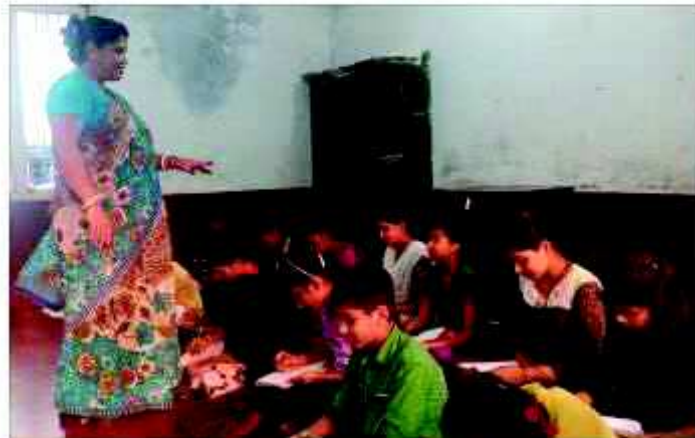
No. of students in the Coachig Class is 40