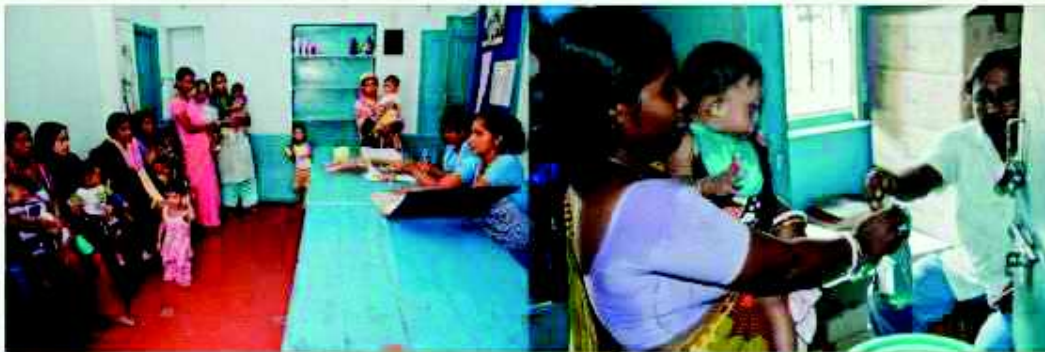
No. of children benefited every week 50

Very poor malnourished children are given Lactogen Milk (400 gm.) and 1 packet Cerelac (300 gm.) every week to consume at their home on the advice of our paediatrician. The children are between the age group of 4 months to 2 years. The children are mostly from the slums of Pilkhana and surrounding areas.