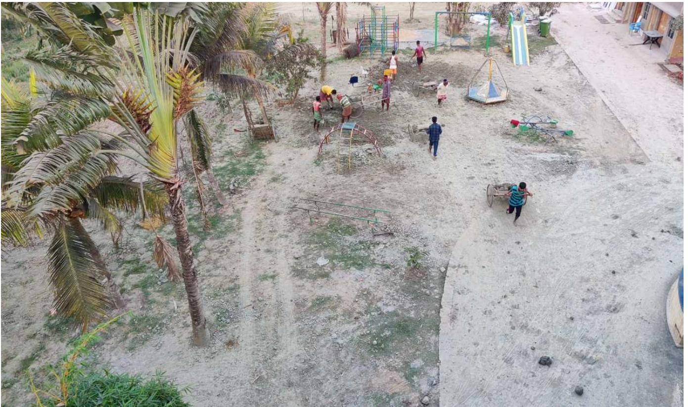
Migrant Labour are working in Earth Filling