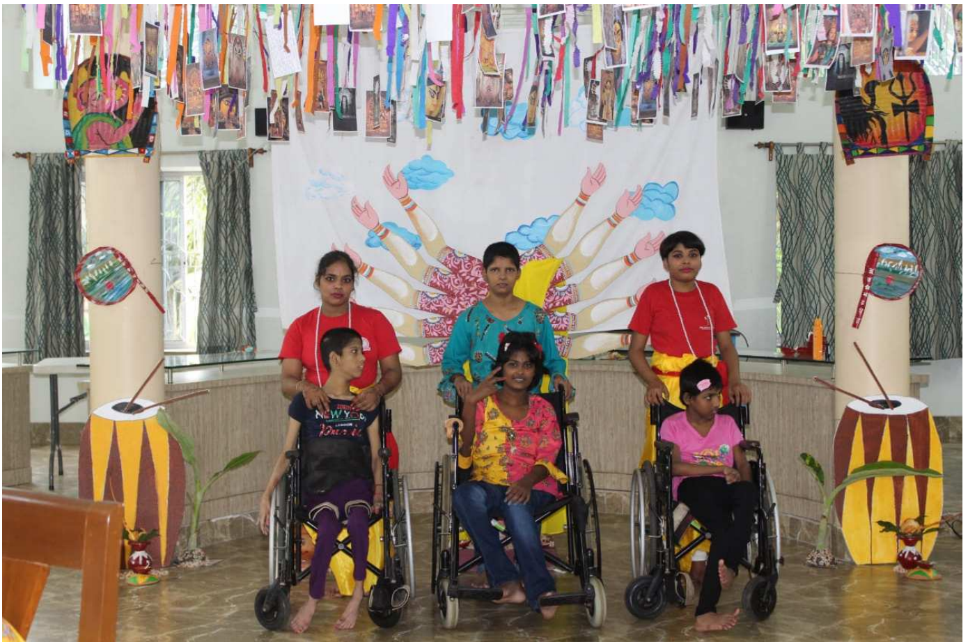
Celebration of Durga Puja