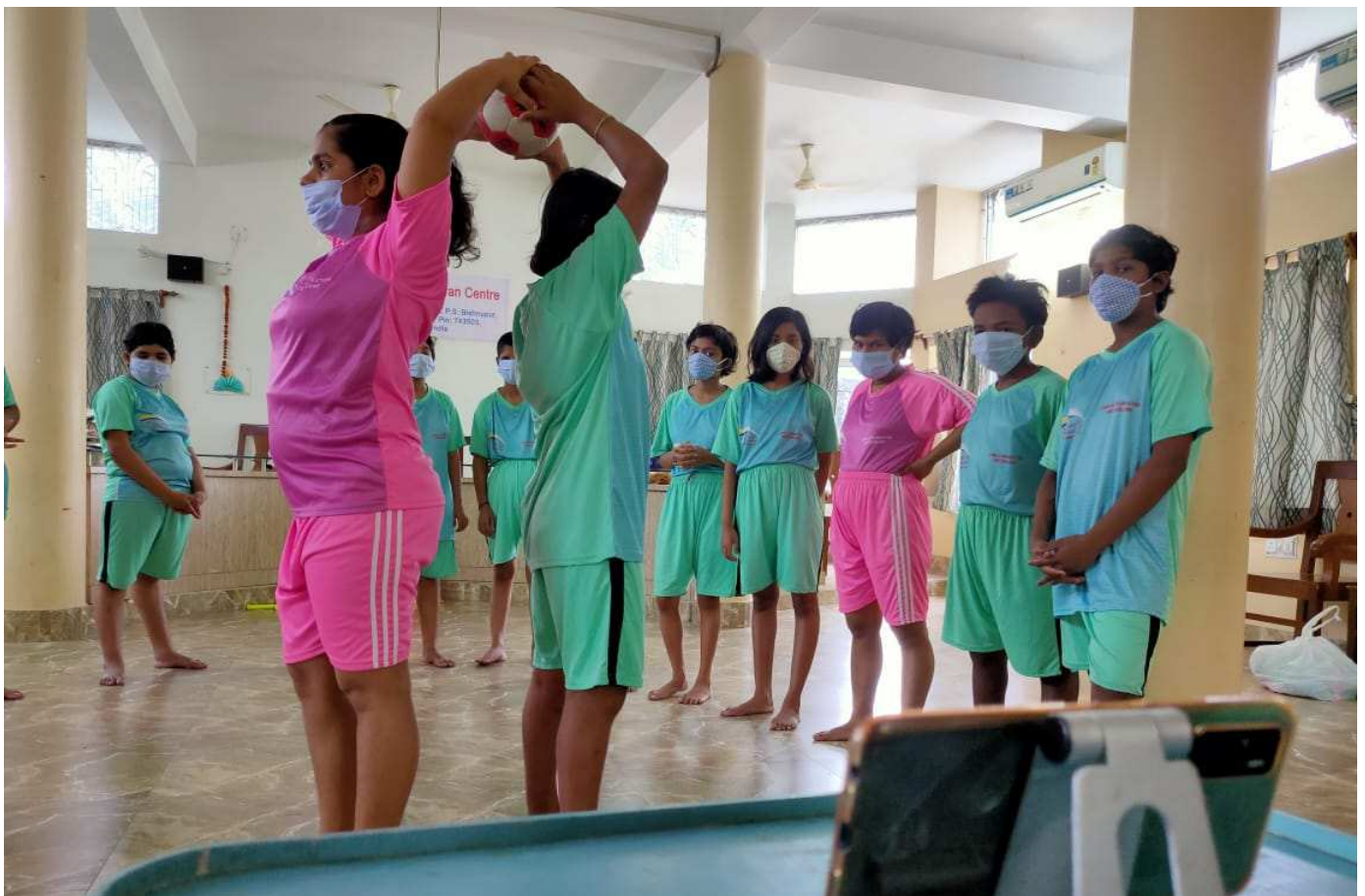
Online Sports Classes during the Pandemic