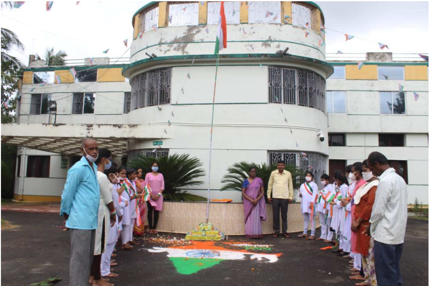
Celebration Independence Day