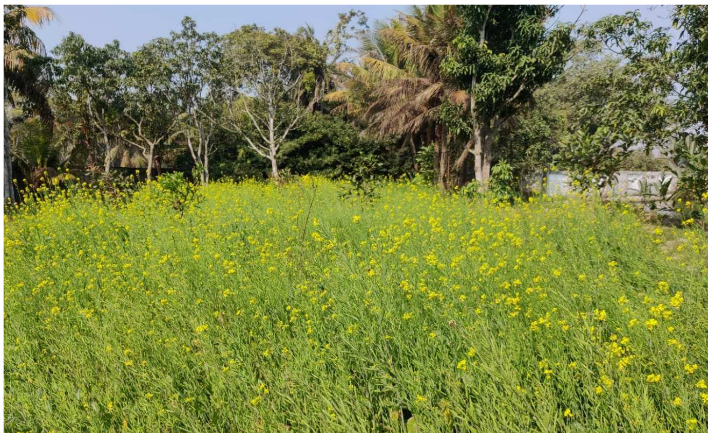
Some pictures of Vegetable Garden