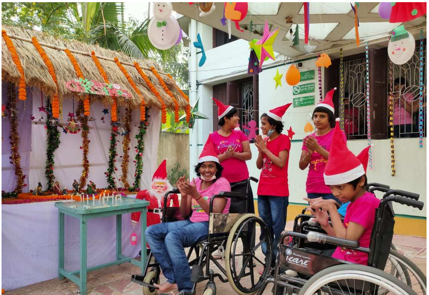
Celebration of Christmas