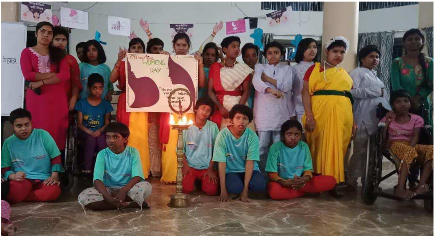
International Women's Day