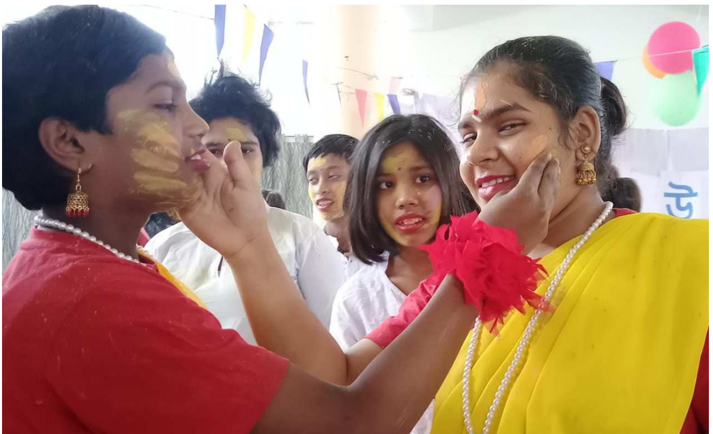
Basanta Utsab (Festival of Colour)